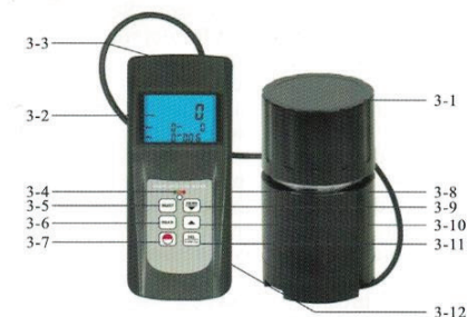
Fig.1 Overall Structure Descriptions