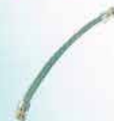
RJ45 network cable