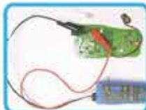
Can test positive and negative pole of DC electric level

Push DIP switch on emitter to position of "SCAN", and long press function switchover button on emitter for 2 seconds, "STATUS" indicator will turn off and "VERIFY" indicator flashes, insert the crystal plug with crocodile clamp into RJ11, clamp the two ends to be tested with crocodile clamps, in case that "STATUS" indicator lights up in red, it means the end clamped with red clamp is positive pole, in case that "STATUS" indicator lights up in green, it means the end clamped with red clamp is negative pole, electric level can be judged by brightness of the status indicators; the lighter the indicator, the smaller the resistance; the darker the indicator, the bigger the resistance.